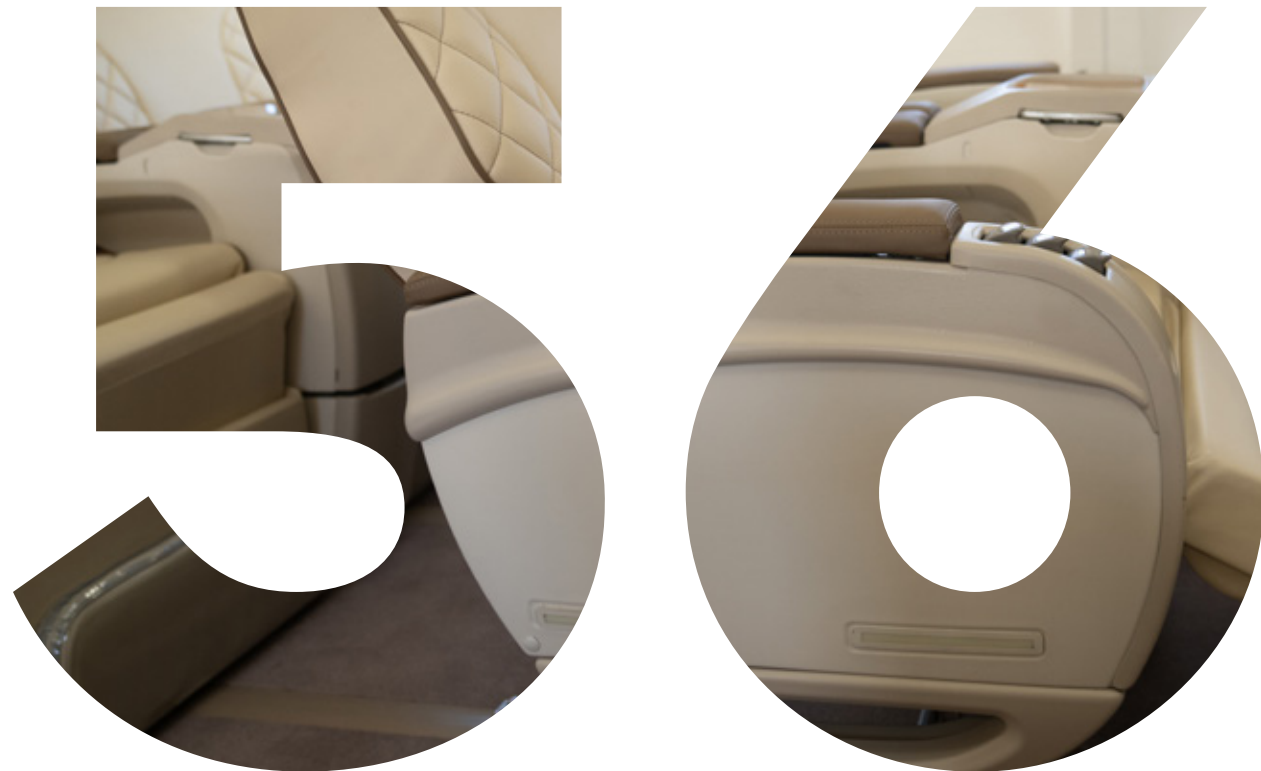
56 VIP / BUSINESS CONFIGURATION