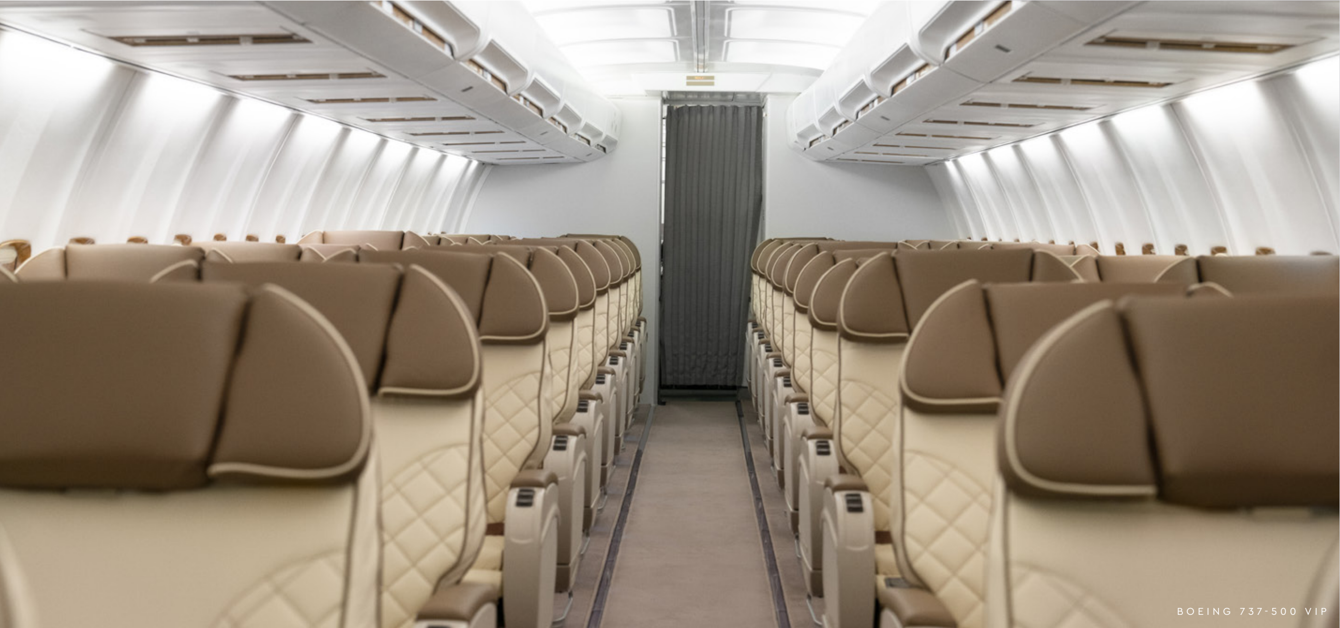
BOEING 737-500 VIP